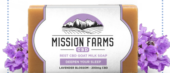
CBD Goat Milk Soaps