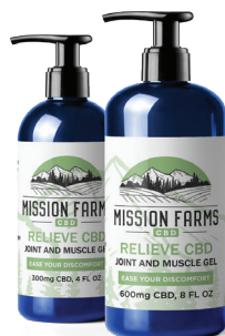
CBD Joint and Muscle Gel