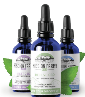
All-natural CBD Oils

We offer a variety of products so that you can find the boost in your well-being in a multitude of ways.