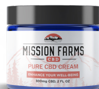
CBD Goat Milk Creams