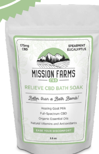
CBD Goat Milk Bath Soaks